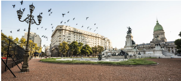
Buenos Aires, Argentina